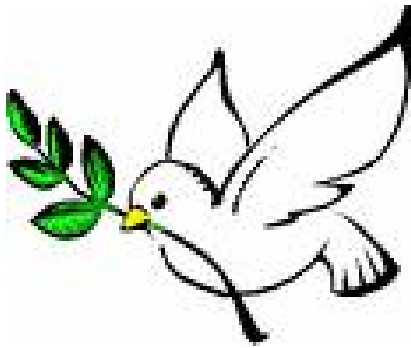
Bringing Peace upon us...